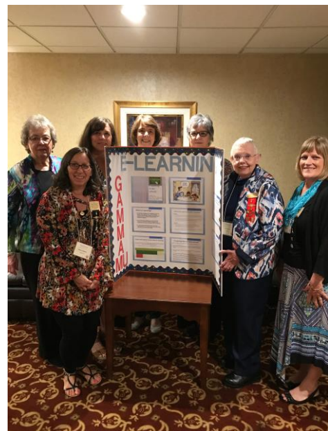
Gamma Mu members showing off their E-Learning poster.